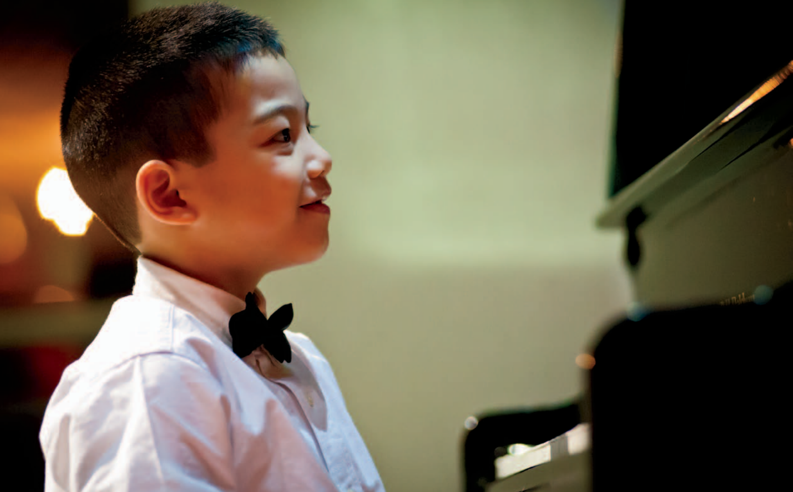
A student performs on the piano.