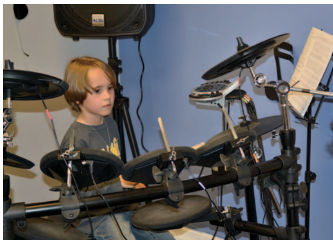
A student plays the drums during a practice session.