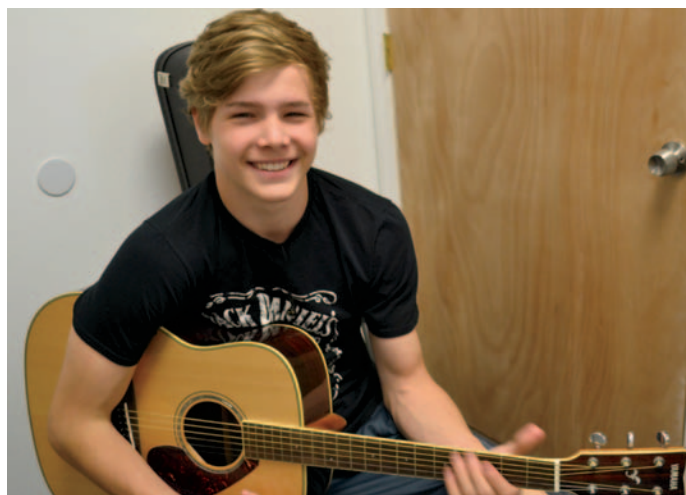
A student at Center Stage Music Center learns the guitar.