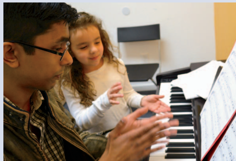
An instructor gives piano lessons to a student at Center Stage Music Center.

To see more instructors, visit centerstagemusiccenter.com .