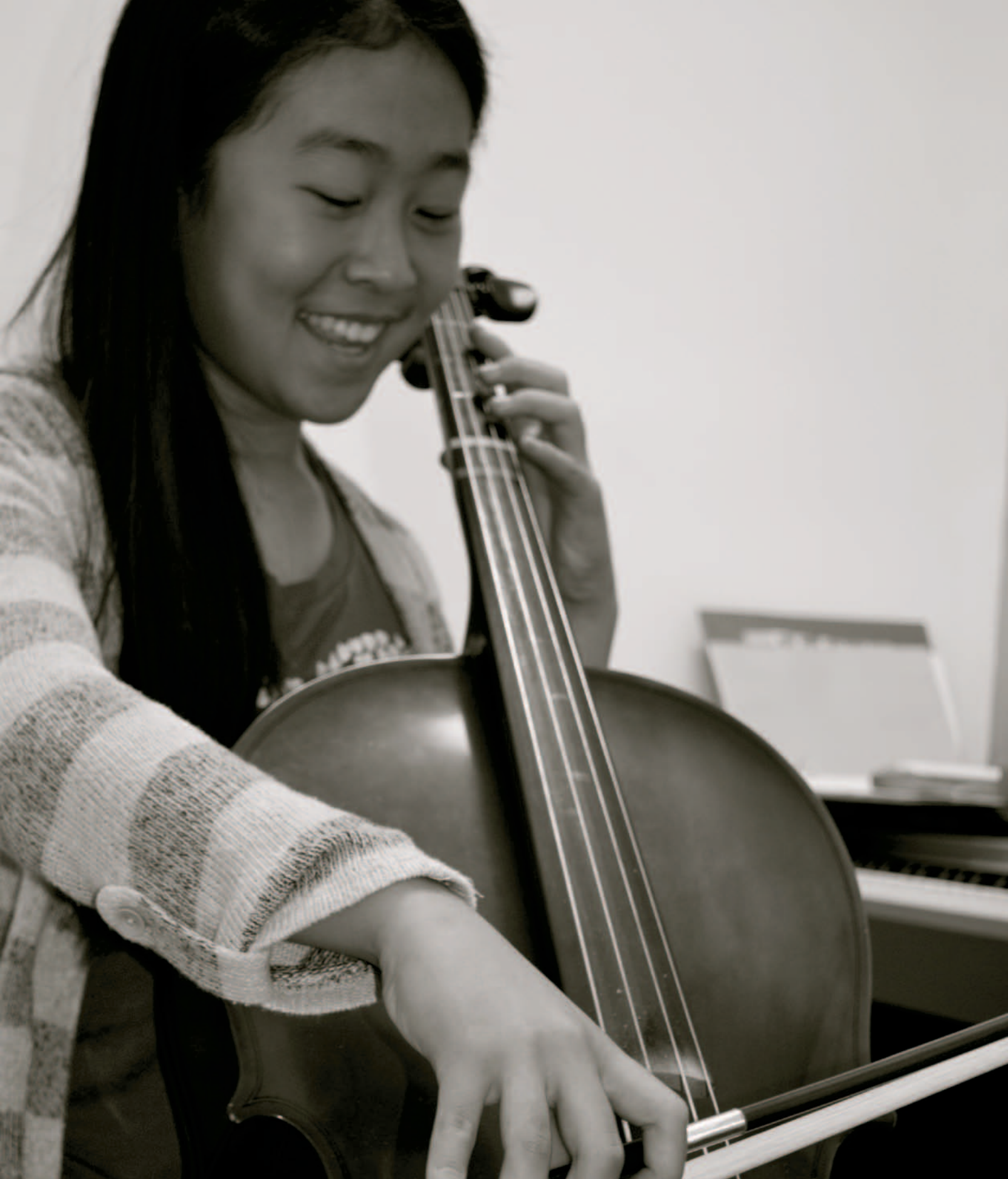
A student plays the cello during a practice session.